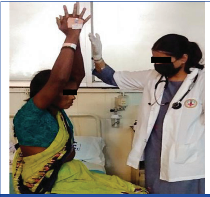
[Table/Fig-5]: Thoracic expansion for improving chest expansion and upper extremities mobility.

[Table/Fig-4]: Shows the list of problems, goals, and interventions